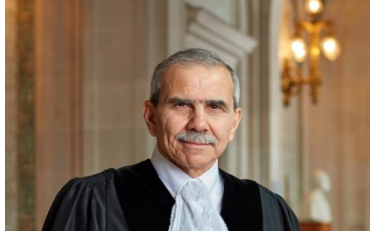
Justice Nawaf Salam