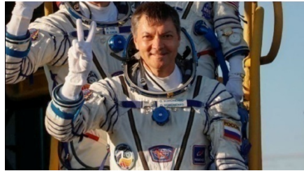
Oleg Kononenko (Russia)

He spent more than 878 days and 12 hours in space, surpassing Russian Gennady Padalka, who set the previous record of 878 days, 11 hours, 29 minutes, and 48 seconds in 2015.